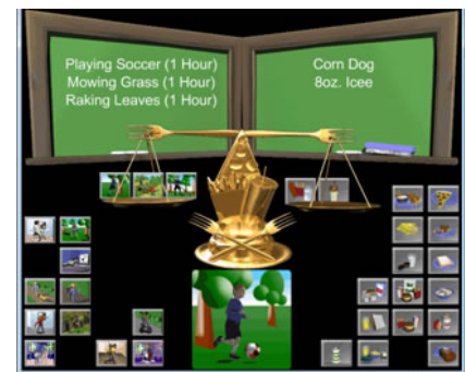
Finding the Balance Developed by Duke University's Center for Wellness

The Nutrition Ambition: Reaching Your Wellness Goals series is a fun and engaging way to teach students and parents about topics such as: Supersizing, Junk Food, Fruits and Vegetables, Water Intake, Sugar Intake, The Role of Sleep, Emotions, and Skipping Breakfast , and to better understand the inter-relationship between: Food, Their Bodies and Body Systems, Nutrition, Metabolism, Exercise, and Health & Wellness.