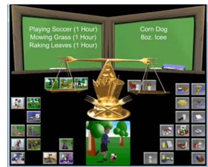
Finding the Balance Developed by Duke University's Center for Wellness

The Nutrition Ambition: Reaching Your Wellness Goals series is a fun and engaging way to teach students and parents about topics such as: Supersizing, Junk Food, Fruits and Vegetables, Water Intake, Sugar Intake, The Role of Sleep, Emotions, and Skipping Breakfast , and to better understand the inter-relationship between: Food, Their Bodies and Body Systems, Nutrition, Metabolism, Exercise, and Health & Wellness .